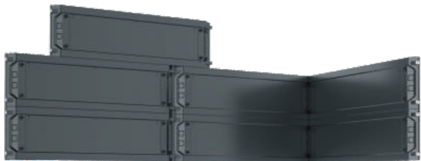
Wrap LED panels around corners.