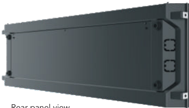
Rear panel view