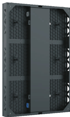
Outdoor panel rear view