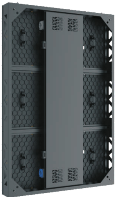
Indoor panel rear view