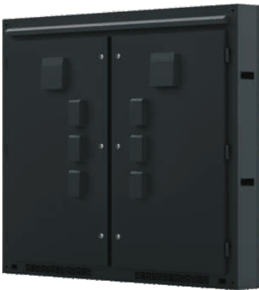
Panel Rear View