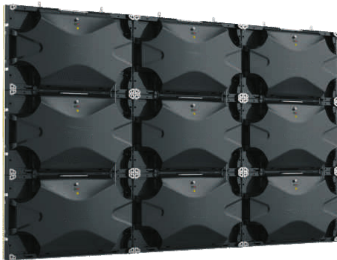
3 x 3 Module Array