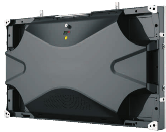
Rear panel view