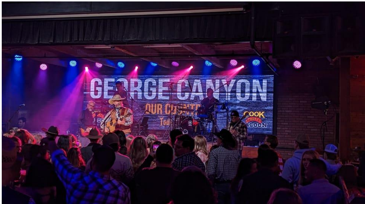
Cook County Saloon – Digital LED Backdrop

Not only does this magnificent VueTronic LED display serve as a central focus in Cook County's user experience, it is a visual enhancement as the backdrop for live music bands, live footage of the crowd dancing, offers sponsorship opportunities for events, and markets internal promotions for the venue.